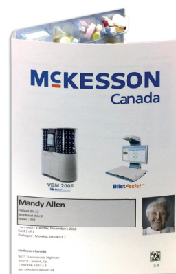
SureMed card prepared by the BlistAssist